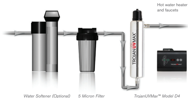
Water Softener (Optional)