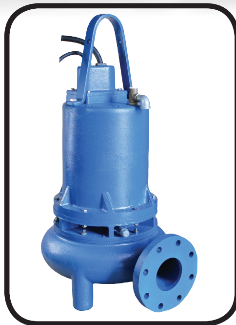
Submersible Non-Clog 4" Discharge, 3" Spherical Solids, Double Seal