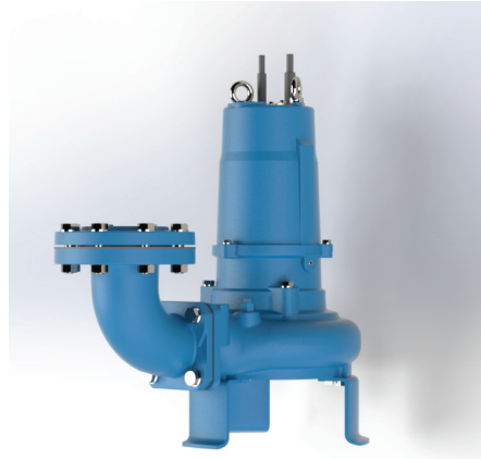
4" NPT with 4" ANSI Flanged Vertical Discharge Elbow (3HP, 5HP)