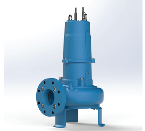
JIS80 to 4" ANSI Flange Adapter (3HP, 5HP)