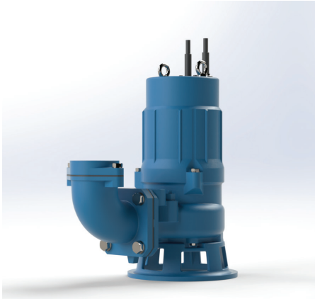
3" NPT with 3" 2-Bolt Flanged Vertical Discharge Elbow (2HP)

* Flange adapter not included with 2HP Models