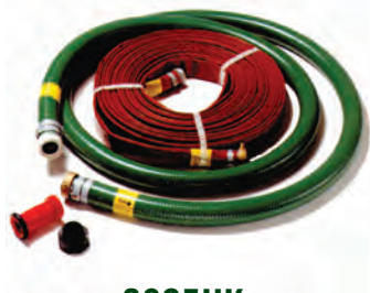
02S5HK 2" High Pressure Hose Kit

2" High Pressure Hose Kit with 20 ft. 2" suction and 100 ft. 1 1/2" high pressure (100 PSI) discharge hose, (1) 1 1/2" fire nozzle, 1 1/2" x 2" adapter and hose wrench.