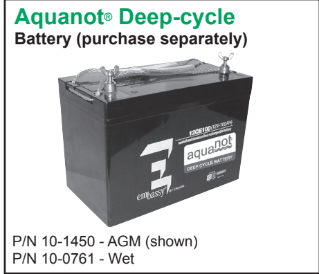
Aquanot® Deep-cycle Battery (purchase separately)

P/N 10-1450 - AGM (shown) P/N 10-0761 - Wet