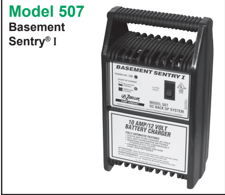
Model 507 Basement Sentry® I