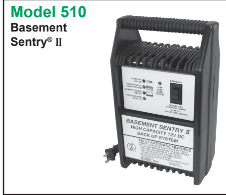
Model 510 Basement Sentry® II