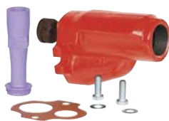
Injector Kit Included