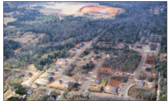
Champion Hills is one of the many subdivisions in rural Mobile County served by Orenco's effluent sewers and treatment systems.

Since 2003, South Alabama Utilities (SAU) in Mobile County, Alabama, has become the subject of nationwide classes, presentations, and tours because of its ambitious and innovative solution for serving nearly 4,000 new customers in 47 new subdivisions in western Mobile County (as well as a number of new schools and commercial properties). How? By installing more than 60 miles