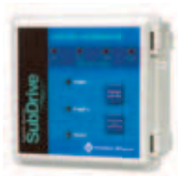
SubDrive Duplex Alternator

*N1 = NEMA 1 (Indoors), N3R = NEMA 3R (Indoor/Outdoors), N4 = NEMA 4 (Outdoors)