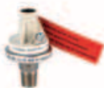
High Pressure Sensor