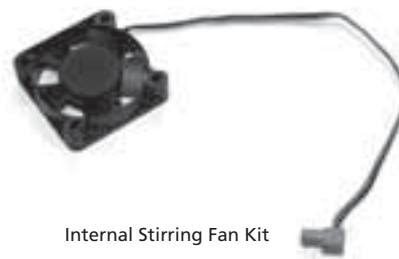
Internal Stirring Fan Kit