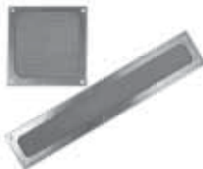
Air Filter Kit