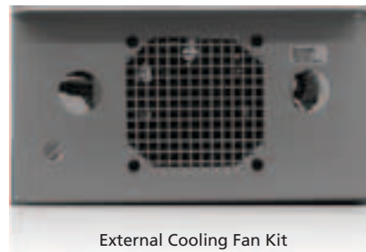
External Cooling Fan Kit